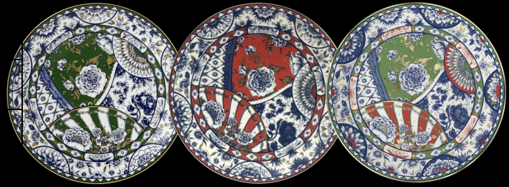
Blue & Green BGG

VGF***62701 27cm Plate (Full Cover) VGB***62701 27cm Plate (Border) VGF***62702 21cm Plate (Full Cover) VGF***62703 16cm Plate (Full Cover) VGB***62576 14.5cm Bowl (Border) VGB***62848 Tea Cup (Border) VGF***62683 Saucer (Full Cover) VGF***00004 Mug (Full Cover) VGF***61156 Cake Stand - 2 Tier (Full Cover)